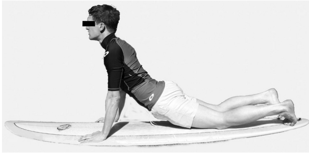
Fig 2. Prone hyperextension of the spine while surfing. This image illustrates the angle closure of the back during hyperextension that is thought to contribute to vascular compromise of the anterior spinal cord.

its radicular arteries, supplying the anterior portion of the spinal cord. The artery of Adamkiewicz typically arises from the left side of the aorta between T8 and L2. It is the only major arterial supply to the anterior spinal artery along the lower thoracic, lumbar and sacral segments of the spinal cord. In the lower thoracic region, the anterior spinal cord is most susceptible to an ischaemic event due to the inadequate collateral vascular supply. Spinal arteries lie on mobile structures that make them prone to mechanical damage. 1 Injury to the artery of Adamkiewicz is well described and can cause neurologic damage with sphincter involvement, impaired motor function, and loss of pain and temperature sensation one level below the lesion. 2